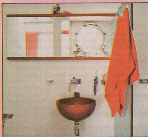
Dominic made the wall-mounted bathroom basin of durable teak.