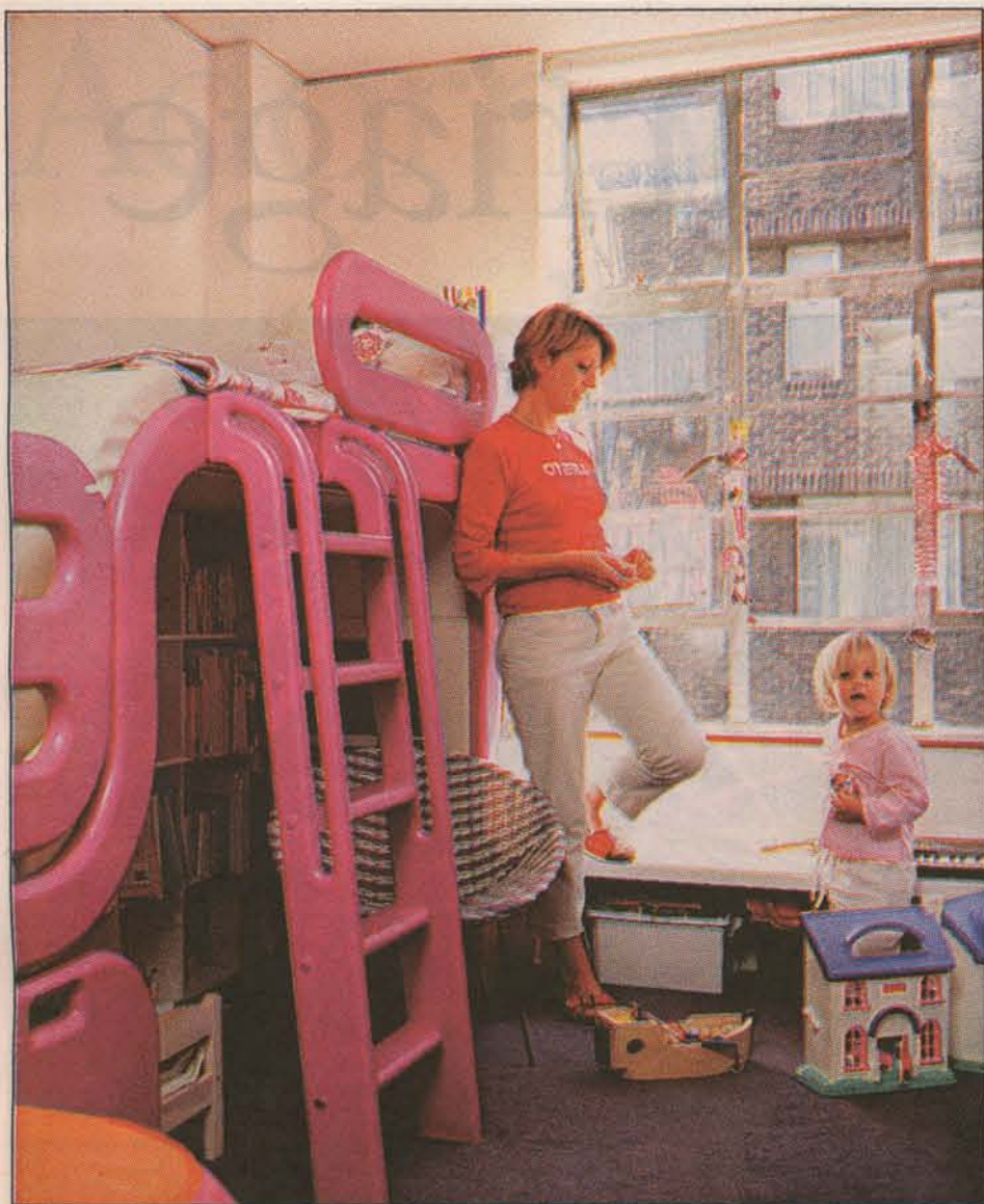
The children's two-in-one bed, with space beneath for toys and playing, is a more inventive take on bunk beds