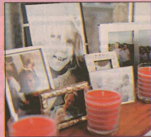
A broad windowsill of walnut wood is an ideal spot for family photos.