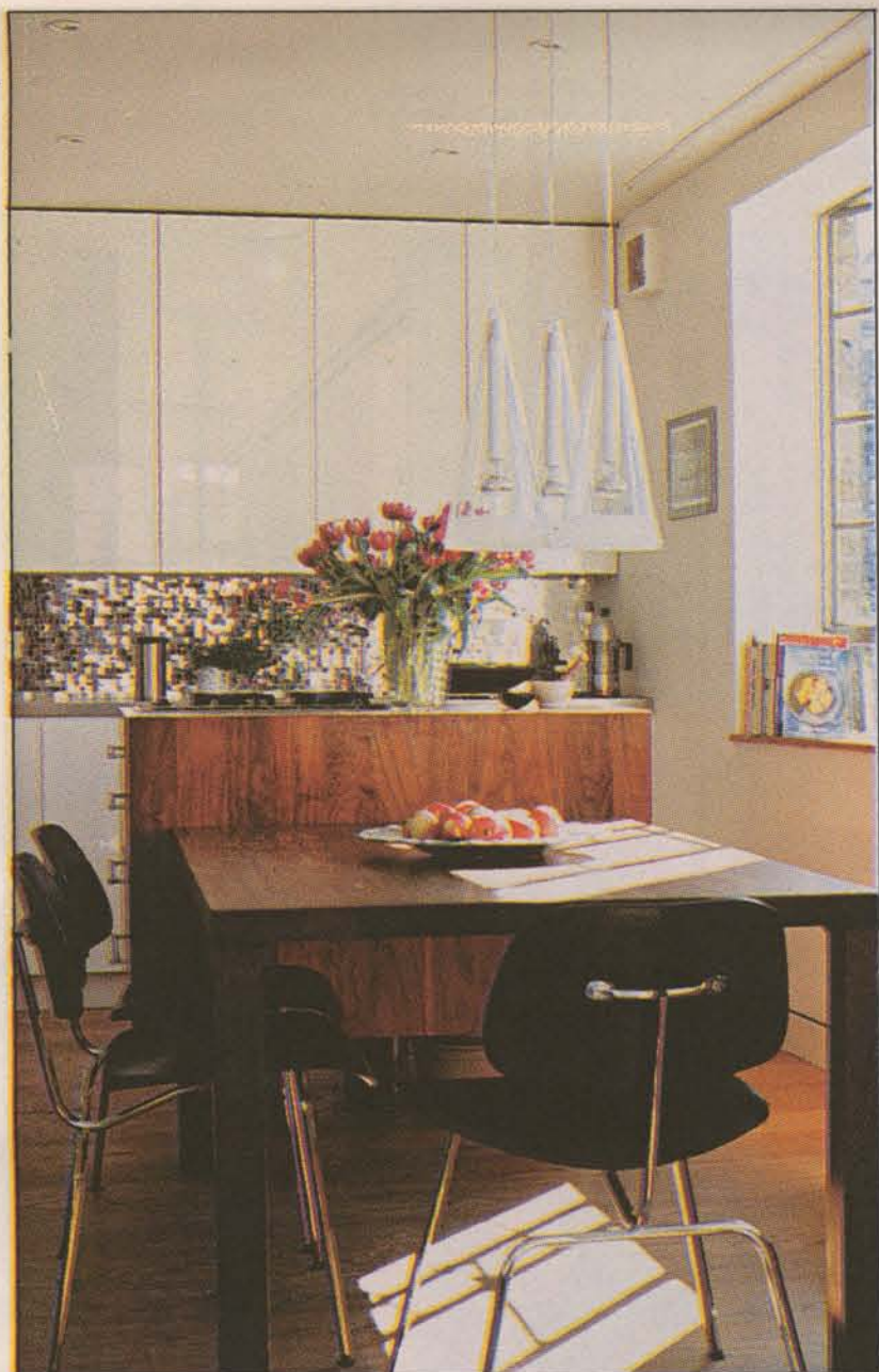
Keeping kitchen units free of handles and giving them a light-reflective surface are two more ways of creating the illusion of space.