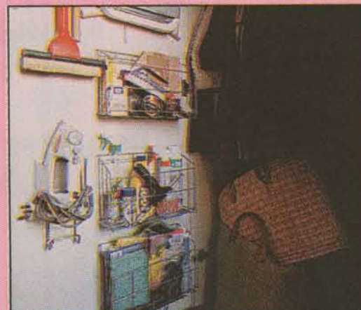
Household utensils are stored snugly on the inside of the hallway cupboard door.