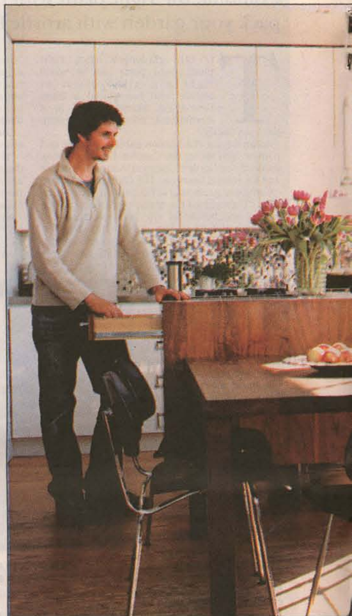
In the kitchen, an all-purpose island block of walnut houses the cooking hol

His ingenious two-in-one bed in Barbie pink is more fun — and certainly more functional — than the usual twin-bunk solution. The curving frame of rubber, which