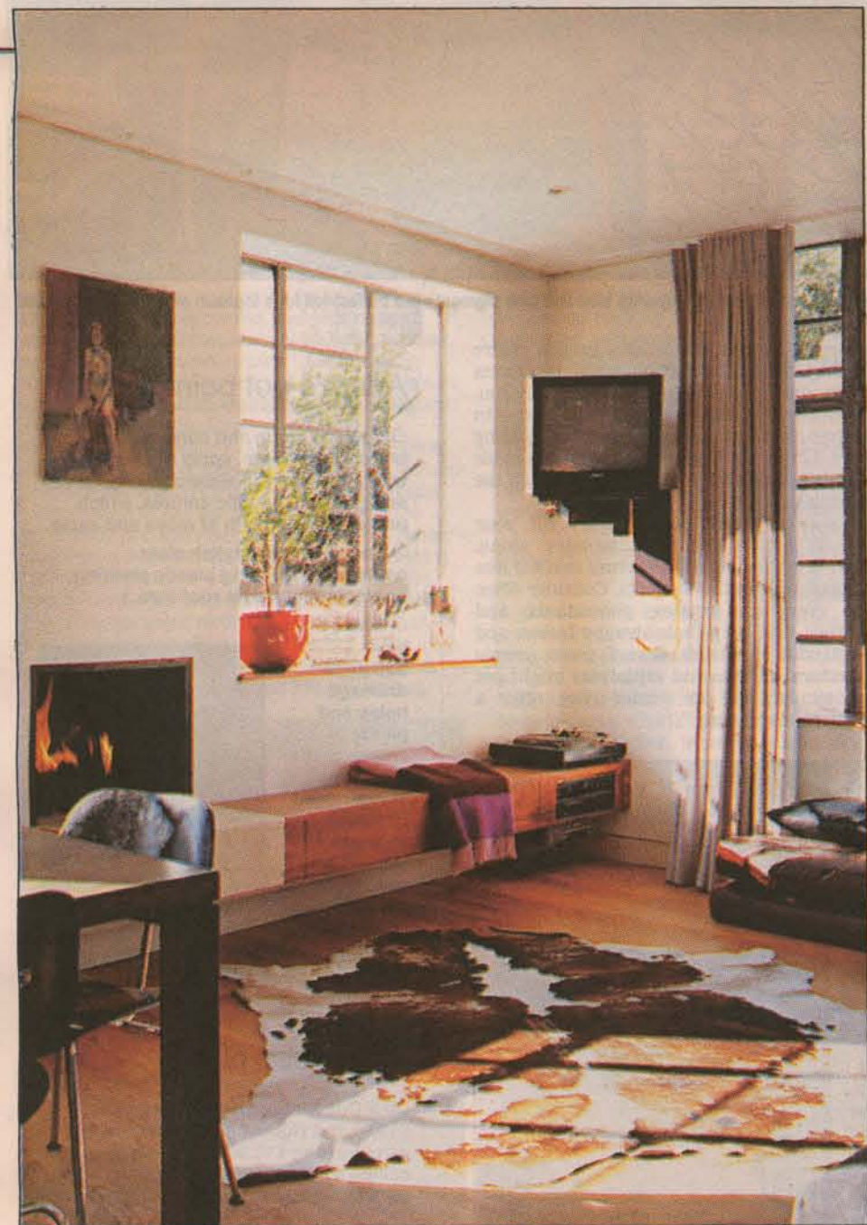
A wall-mounted TV and "floating" wall bench that doubles as storage frees up the living area

The couple's bedroom is even smaller, but Dominic rose