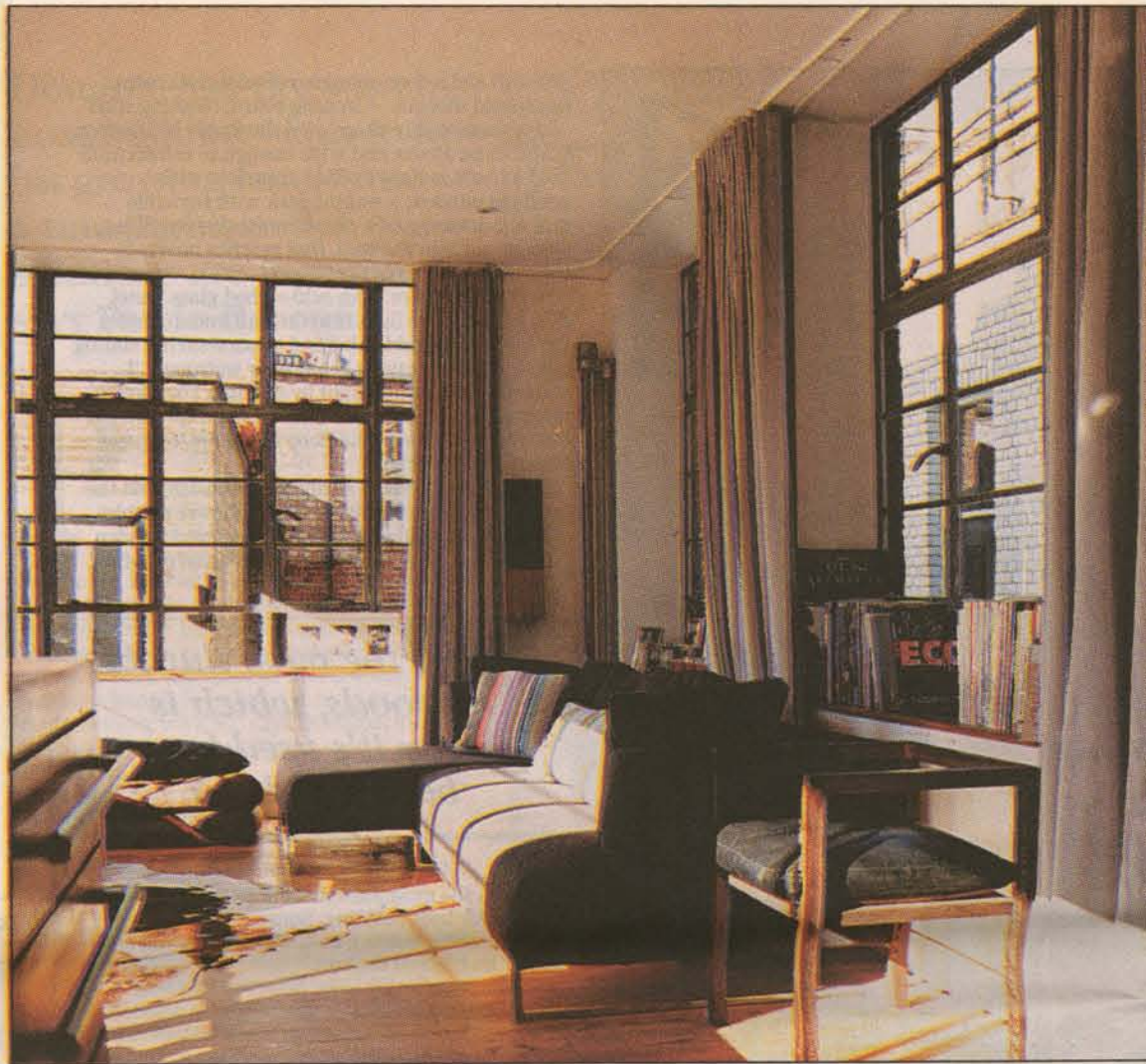
The couple invested in a smart charcoal-grey sofa by B&B Italia, which has modular pieces that slot neatly around the corner of the main living area, streamlining the space: Velvet curtains run on a track all the way around, wrapping the room in warmth and luxury.