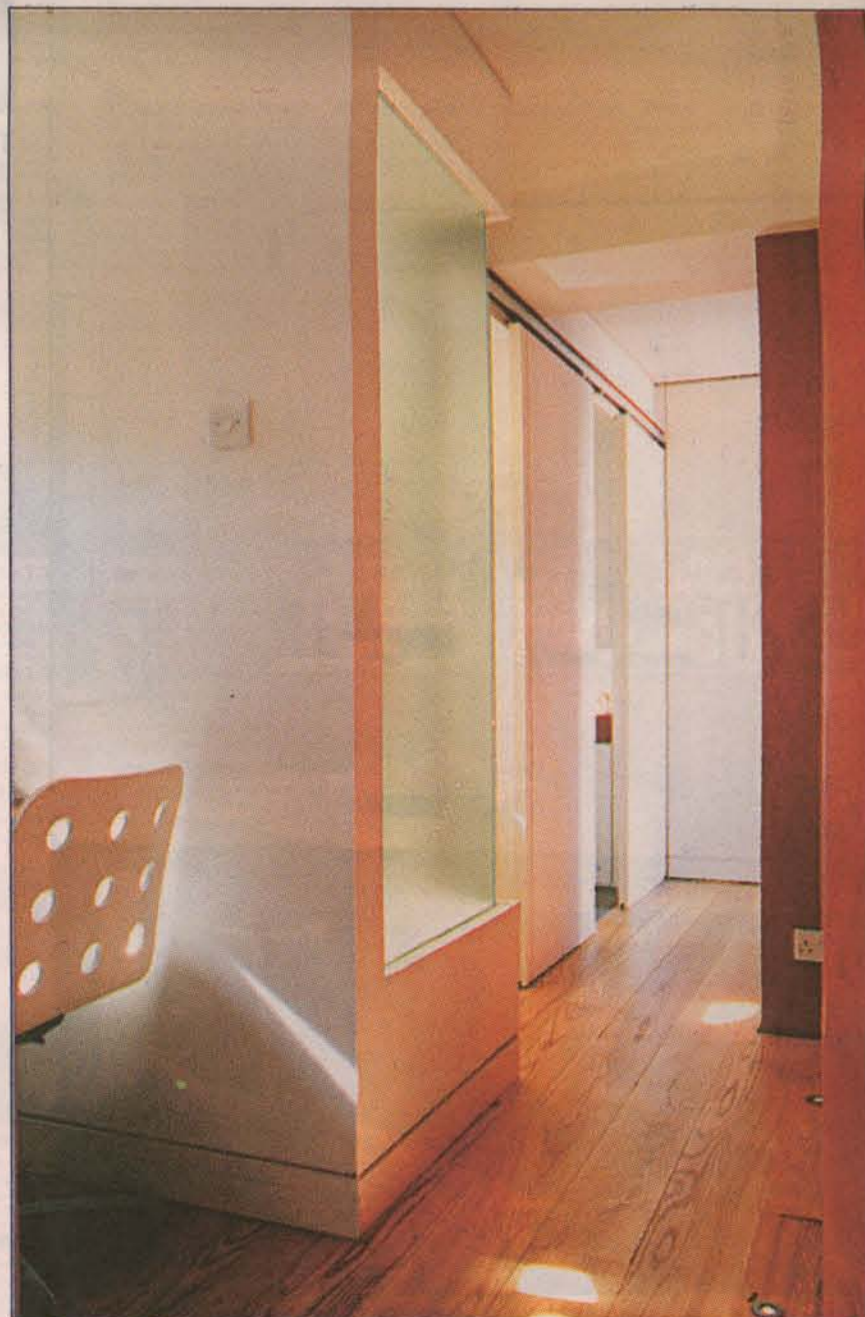
To give the hallway a light, airy feel, Dominic used sliding panels for doors, set small spotlights into the floor and introduced a panel of acid-etched glass, which backs onto the bathroom