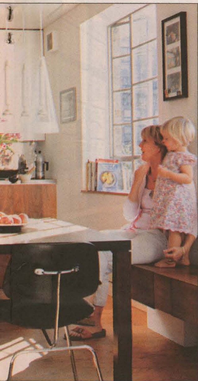
hob, mini-larder, rubbish bin and glide-out cutlery drawers

to the challenge, making a high platform bed of maple, with deep glide-out drawers beneath for shoes and separates. Opposite, looking just like a mirrored wall, is the seamless wardrobe, with no-show touch latches.